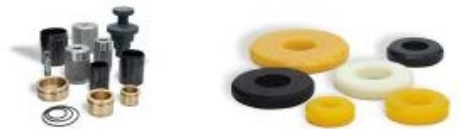
IN HOLE TOOLS