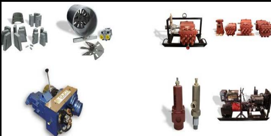
DRILL RIGS & PARTS