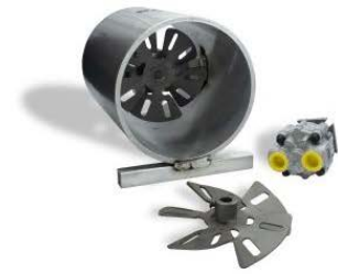
MUDMIXER & PARTS