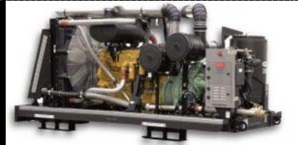
BOOSTERS & COMPRESSORS