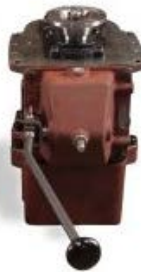
TRANSMISSIONS & PARTS